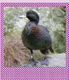
Blue duck (Whio)