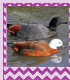
Paradise shelduck (Putangitangi)