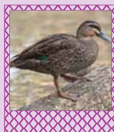
Grey duck (Parera)