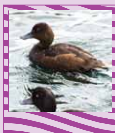
New Zealand scaup (Papango)