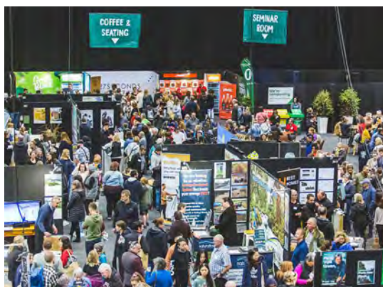
Above: Packed crowds at the Christchurch Go Green Expo.

You can download or order your free copy of the Plant-Based Starter Guide at: safe.org.nz/take-action/guide-to-goodness