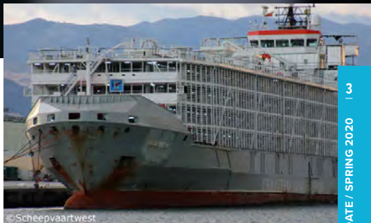
Above: Live export ship Gulf Livestock 1

With your support SAFE launched an ambitious international awareness campaign to shine the spotlight on New Zealand’s continuing cruel live export