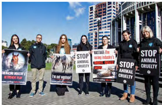
Above: SAFE stood outside parliament in solidarity with the Coalition for the Protection of Racehorses.